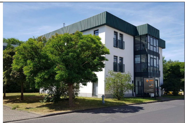
View of the new ARJES GmbH headquarters in Merkers, Thuringia