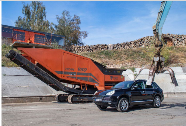
An exciting time on the ARJES test site. Will the TITAN 950 manage to shred the wide-built Porsche Cayenne?