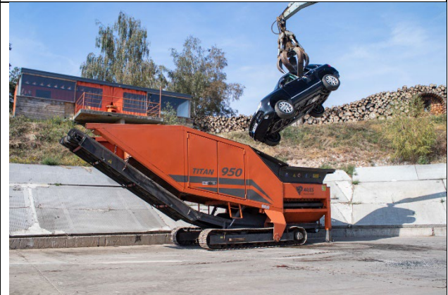
There's no turning back now. This luxury car will be torn to pieces any moment now.