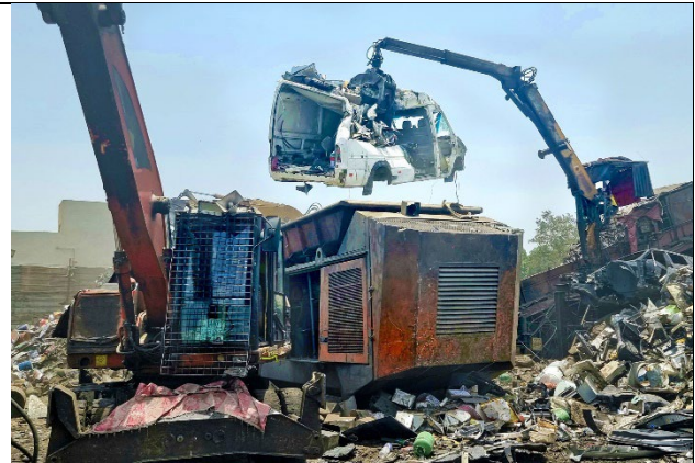
In operation shredding car bodies 6 days a week