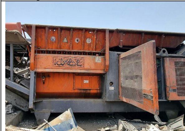
The VZ 950 from ARJES has operated effectively for over 12,000 hours